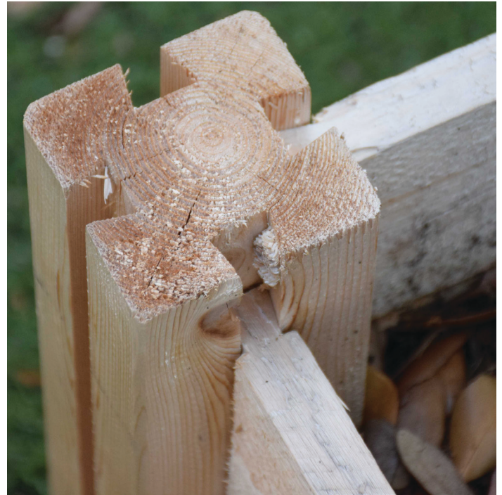
Figure 4. Example of corner post with grooves that allow 2" wood sides to slide in which makes it easy to construct and dismantle.

long sides). Purchase ninety 3" long deck screws. Stainless steel screws are preferred when using ACQ treated lumber. However, if you are on a limited budget, look for screws with a coated finish guaranteed not to corrode when used with ACQ treated lumber.