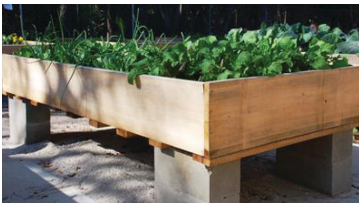
Figure 1. Example of an elevated raised bed ideal for individuals in wheel chairs or for those who cannot bend over.

Raised beds offer many advantages. Traditional gardening takes a toll on knees and backs, whereas gardening in raised beds helps save the joints (Figure 1). Many gardeners cannot grow vegetables in traditional gardens because soils are poor, too wet, compacted, or plagued with nematodes and other soilborne pests. Raised beds allow you to control the soil to avoid these issues. Another plus is that soils aboveground heat up more quickly so you can get a jump on the spring gardening season. Also, raised beds are typically more productive than in-ground vegetable gardens because the planting medium is easier to improve and there is no wasted space for walkways between rows.