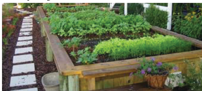
Figure 2. Raised beds can be elaborate and esthetically pleasing.

Next, determine the size and height of the raised bed. It should be no wider than 4' because most people can only comfortably reach 2' to the center. The length varies and depends on the site. A common size is 4' wide x 8' long x 16"–24" deep. The height really depends on the level that is most comfortable for you and the investment you want to make in materials. The site may lend itself to multiple beds but make sure to give yourself ample room between beds—about 18"–24". Beds can be various shapes (e.g., square, rectangle, L shaped, triangle). Raised beds can be basic or very elaborate and esthetically pleasing in the landscape (Figure 2).