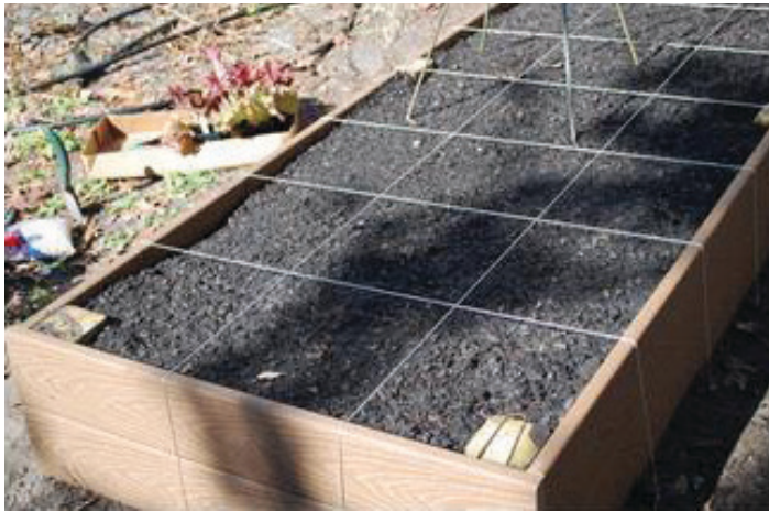
Figure 3. A raised bed using synthetic wood is more expensive than ACQ treated lumber but will last longer.

Options for building materials include stone, bricks, concrete blocks, synthetic/recycled materials, or wood. If using concrete, pre-cast concrete blocks are acceptable to use for creating raised beds for edibles. But if using poured-in-place concrete, there are potential problems associated with some of the curing compounds, stains and sealers that are sometimes used, and with the release agents typically used on the wood forms. Wood is the most common material and is relatively inexpensive, but untreated lumber starts to rot within a year. For longevity and cost effectiveness, use ACQ Ground Contact treated lumber, which is treated with new copper preservatives and approved by the Food and Drug Administration for food production. Cedar, redwood, and synthetic wood (Figure 3) are also durable, but they are more expensive than ACQ treated lumber. Avoid using railroad ties or old pressure-treated lumber purchased prior to 2004 for edibles because of the potential for food contamination from creosote and arsenic.